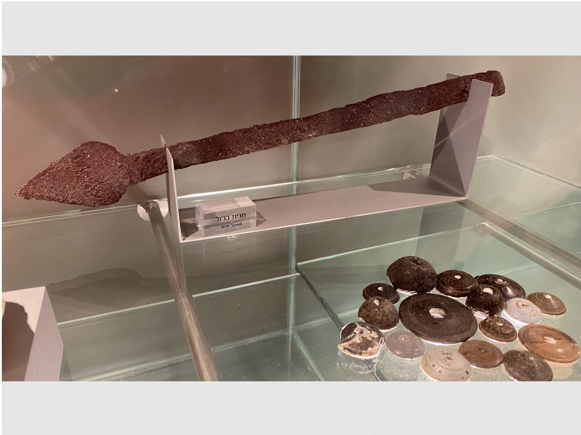
חנית ברזל Iron Spear